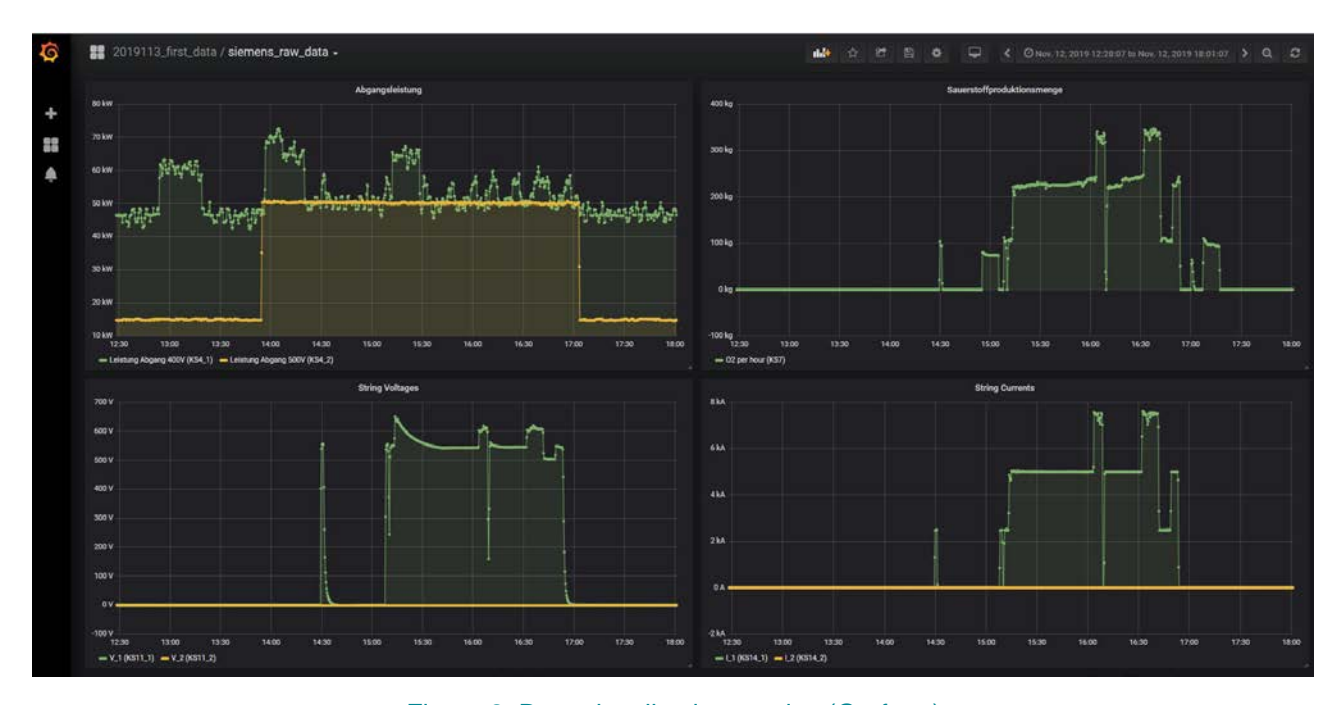
Figure 2: Data visualisation service (Grafana)

Figure 2 shows the data visualisation service of the data warehouse (Grafana - <a href="https://grafana.com/grafana/">https://grafana.com/grafana/</a>). It offers the possibility to show, to select and to export data for different timeframes.