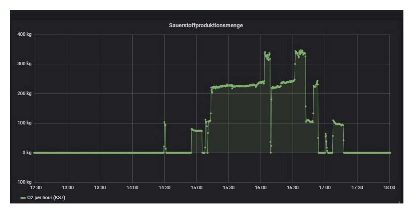
Figure 3: Data visualisation service – example of O2-production

Additionally, the imported data was analysed and plausibility checks were implemented. For each data point a valid range can be defined for the plausibility checks.